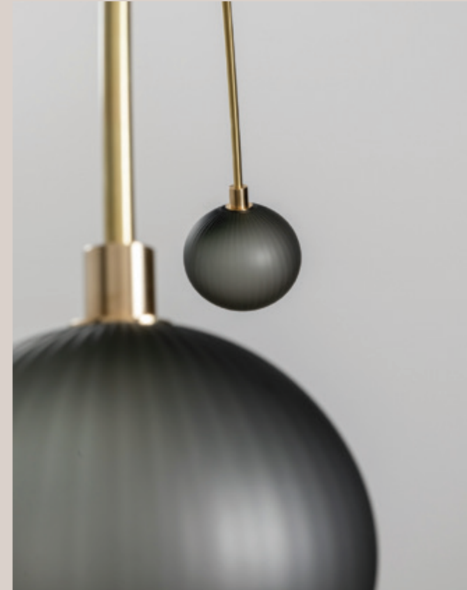
BALANCE 2.0 PENDANT