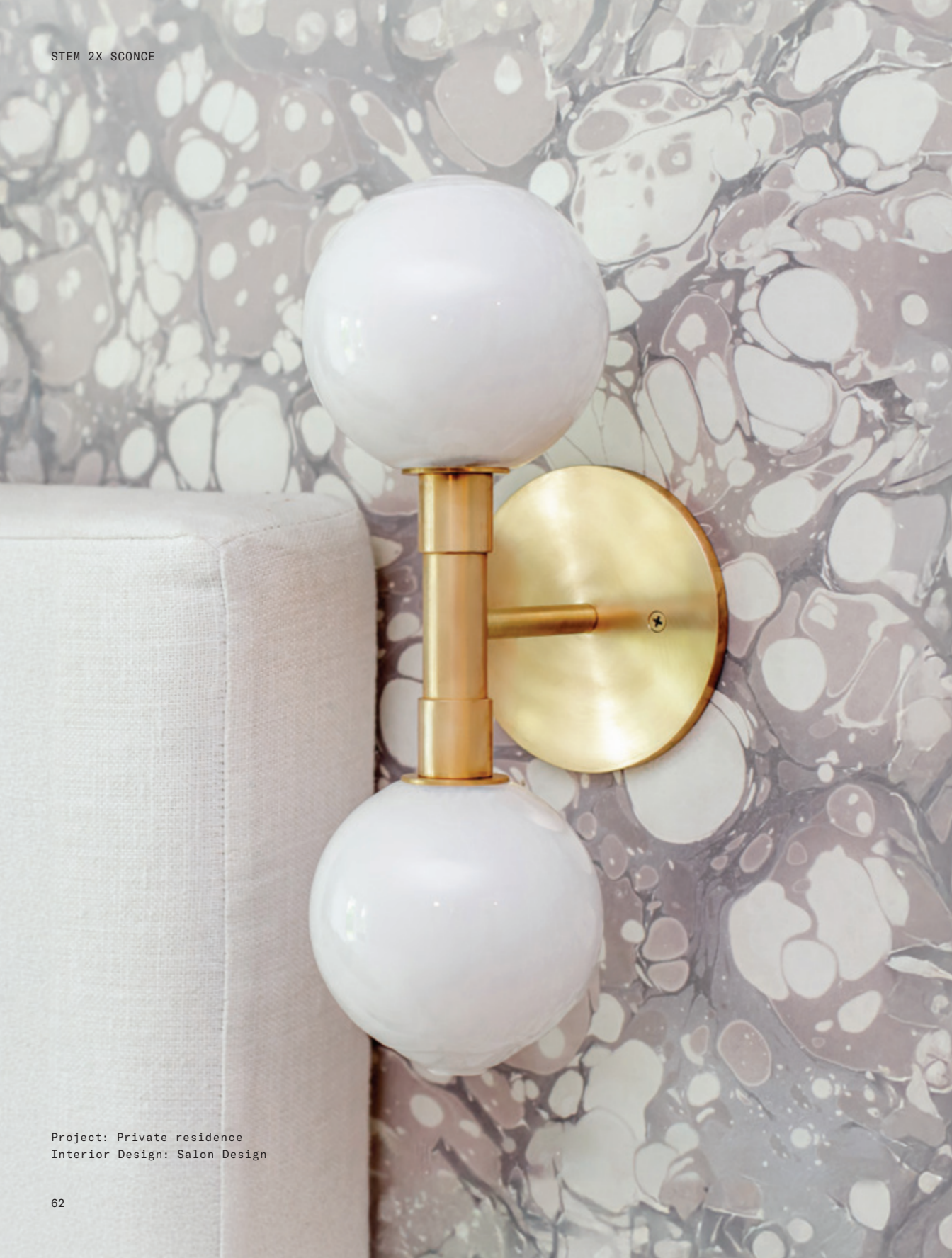
Project: Private residence Interior Design: Salon Design