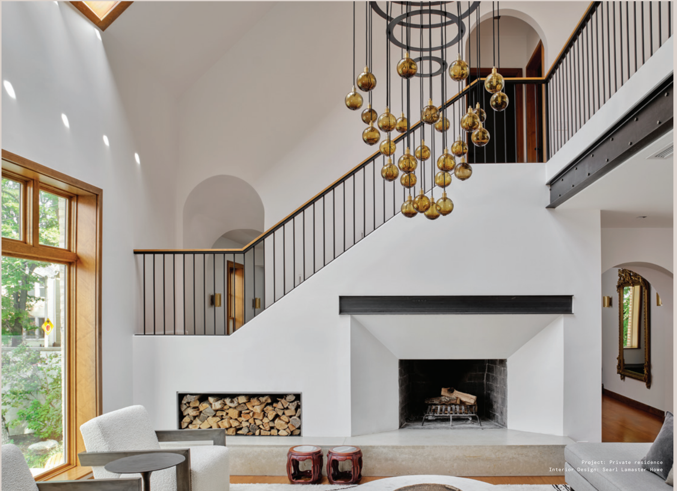
Project: Private residence Interior Design: Searl Lamaster Howe