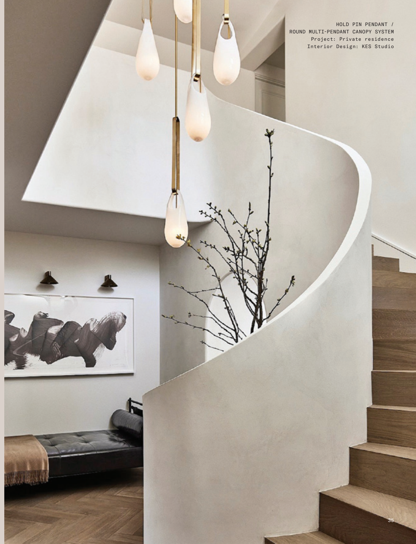
HOLD PIN PENDANT / ROUND MULTI-PENDANT CANOPY SYSTEM Project: Private residence Interior Design: KES Studio