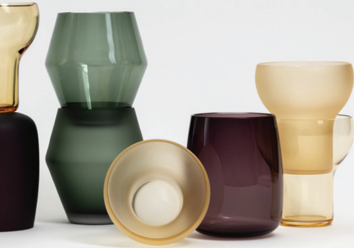
BELL GLASS / DIAMOND GLASS / TRACE GLASS

We've been quietly designing custom drinkware and other glass tabletop objects for luxury hotels, restaurants, and wineries for many years. The Trace glass got its start as a prototype for one such project, and ultimately inspired us to develop the collection. With its smaller scale, inviting direct touch and human interaction, the Tabletop Collection brings a new intimacy to SkLO objects.